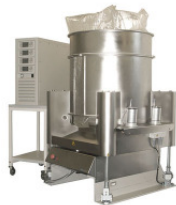
Figure 1. SB200-X orbital shaken bioreactor